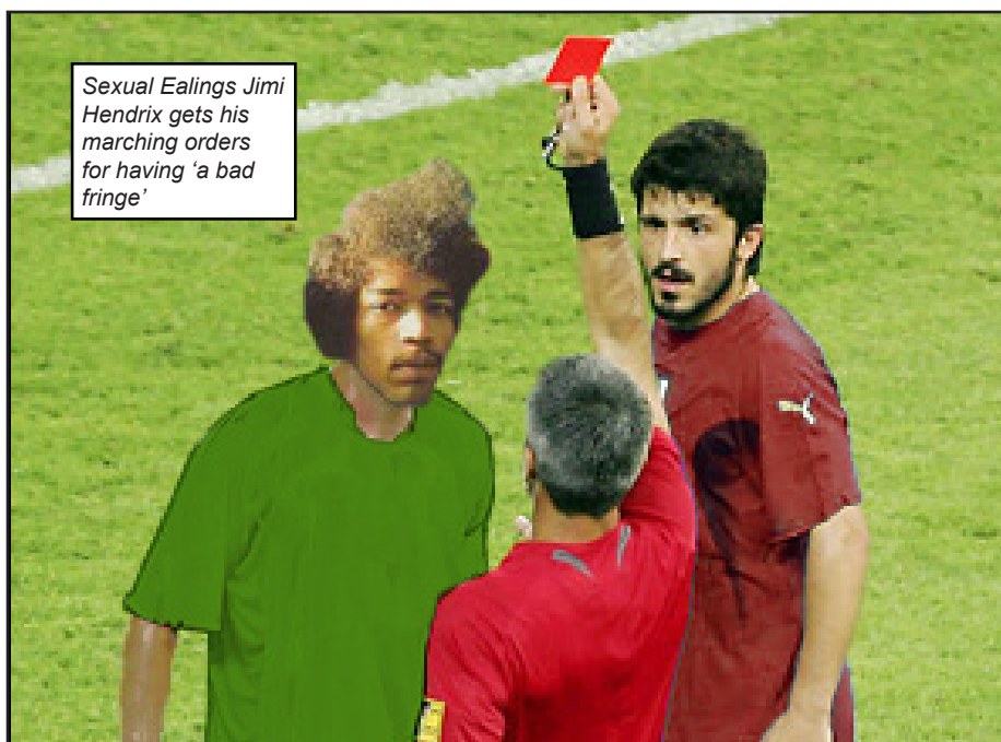
Sexual Ealings Jimi Hendrix gets his marching orders for having ‘a bad fringe’